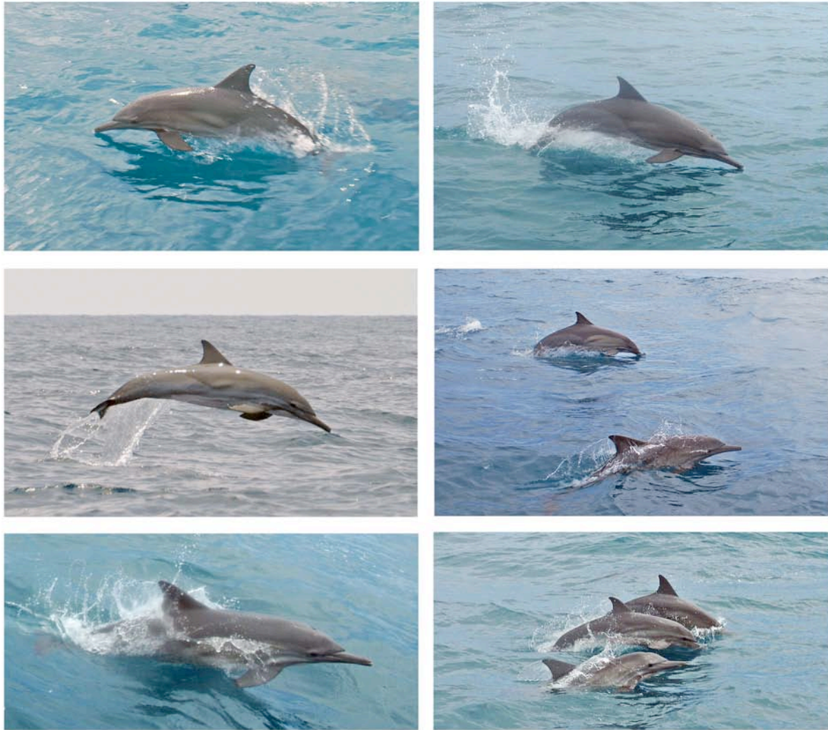
Figure 2. Photographs of long-beaked common dolphins ( Delphinus capensis ) taken on 9 and 17 May 2012 off the lower Guajira Peninsula near Mingueo, municipality of Dibulla, northern Colombia. The diagnostic external morphology and colouration pattern of the species are evident in all images. Although the pattern is rather muted, note how the tan-coloured thoracic patch is interrupted by a secondary dark stripe that runs forward and upward from the eye-to-anus stripe.